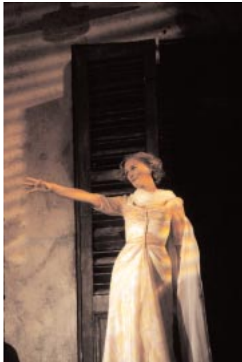
Glenn Close