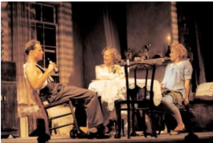
Iain Glen, Glenn Close, Essie Davis

Williams' grandmother was a music teacher, and his mother was a singer. Music to Williams was a major source of inspiration. His foreword to Camino Real talks of jazz experiments which are "a new sensation of release, as if I could ride out like a tenor sax, taking the breaks in a Dixieland combo or a piano in a bop session" . Overlaying music, sound, light, and textures, Williams was able to blur the line between realism and subjective expressionism.