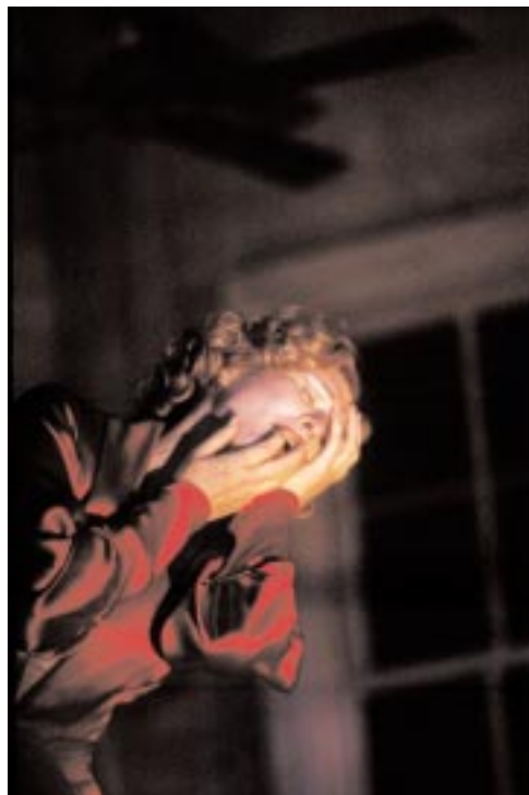
Glenn Close

Nothing had prepared the audience for the searing and complex adult themes of the play. One critic called it the product of an "almost desperately morbid turn of mind" . In contrast, another described it as "a revelation. A lyrical work of genuine originality and disturbing power" . Such were and continue to be the extreme reactions to the play.