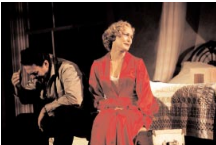
Robert Pastorelli, Glenn Close

Williams grew up during the Depression, flirting with radical politics and regarding himself as something of a 'revolutionary'. He was drawn to theatre that addressed the concerns of the world. Theatre was no longer a place to be simply entertained, when on the streets people were homeless and starving. He debated political corruption, rarely voted, denounced America's war involvements and, as a homosexual, found himself harassed and threatened in a brutal world. A world without freedom to speak one's mind and to be the person one wants to be.